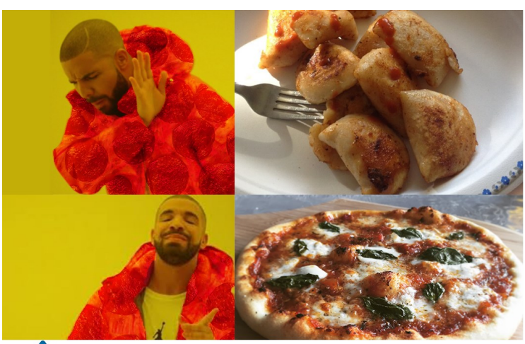
IEEE Pizza Sales Every $2.50/Slice Outsig