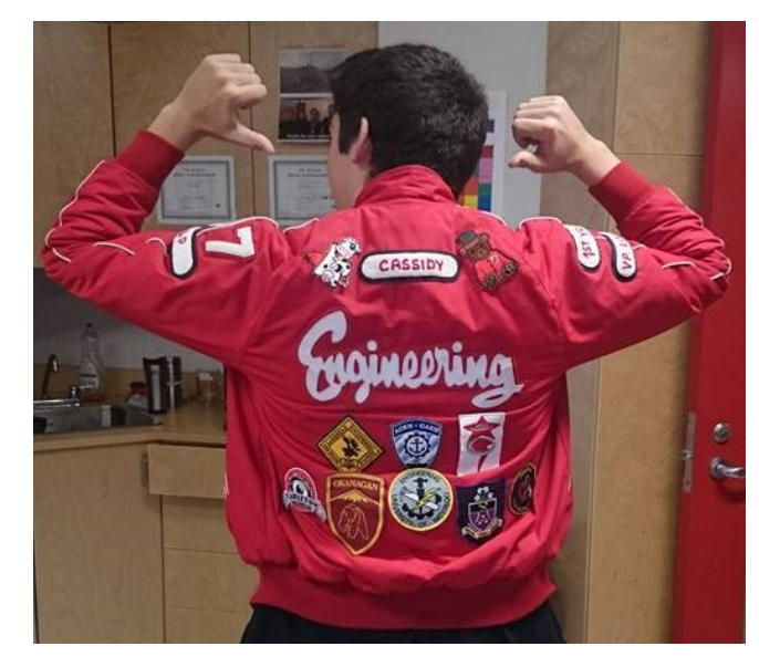
Poofie/ arm bar/ discipline jacket order forms are due October 15th! Come to the Office to order yours today!